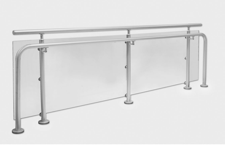
Interna-Light™ with VUE Glass Infill Panel Railing